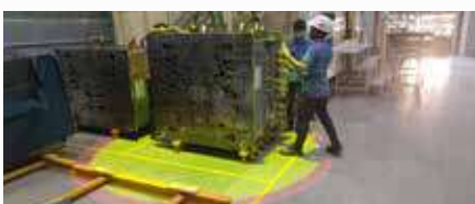
Mounting on crane