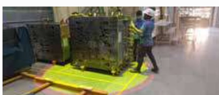
Mounting on crane