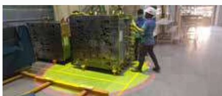
Mounting on crane